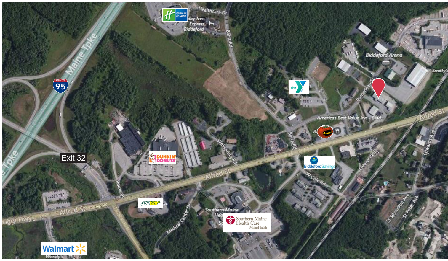
The information contained herein has been given to us by the owner of the property or other sources we deem reliable. We have no reason to doubt its accuracy, but we do not guarantee it. All information should be verified prior to purchase or lease.