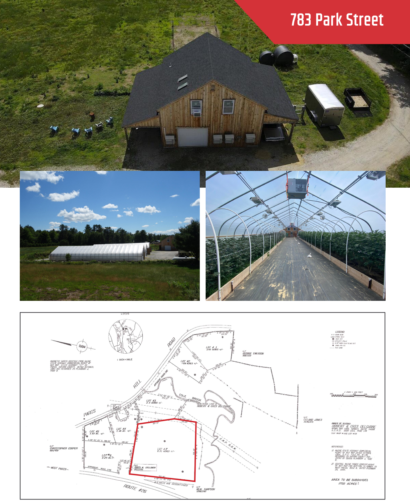
The information contained herein has been given to us by the owner of the property or other sources we deem reliable. We have no reason to doubt its accuracy, but we do not guarantee it. All information should be verified prior to purchase or lease.