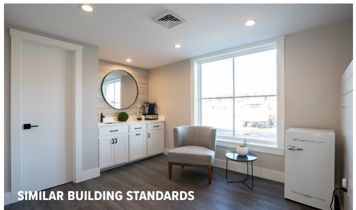
SIMILAR BUILDING STANDARDS