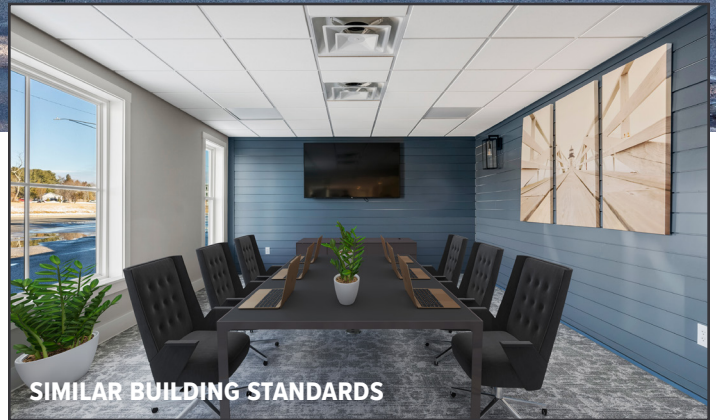
SIMILAR BUILDING STANDARDS