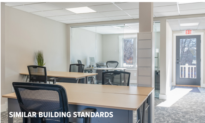
SIMILAR BUILDING STANDARDS