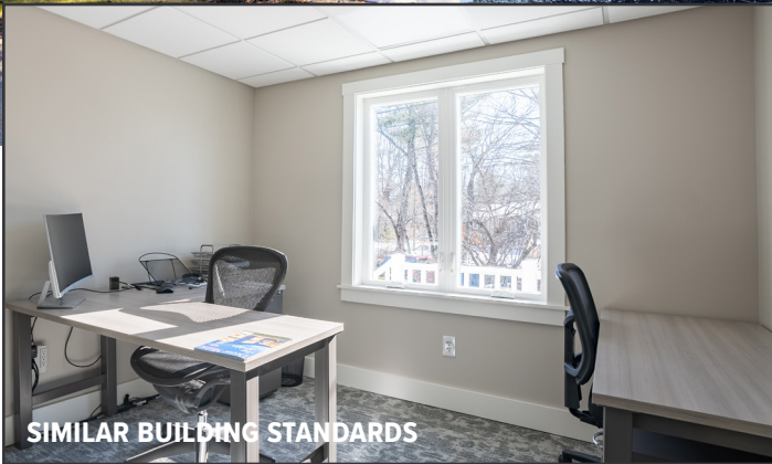
SIMILAR BUILDING STANDARDS