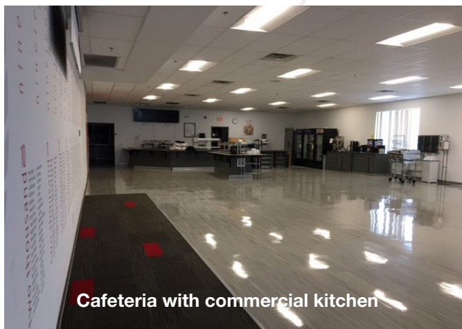
Cafeteria with commercial kitchen