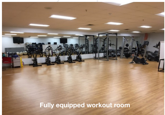
Fully equipped workout room