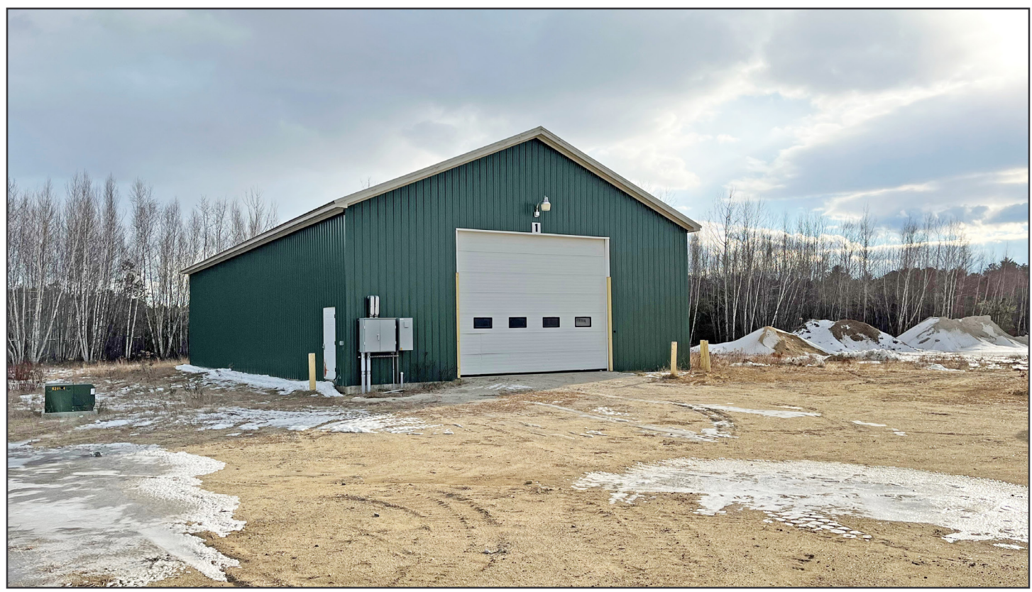
The information contained herein has been given to us by the owner of the property or other sources we deem reliable. We have no reason to doubt its accuracy, but we do not guarantee it. All information should be verified prior to purchase or lease.