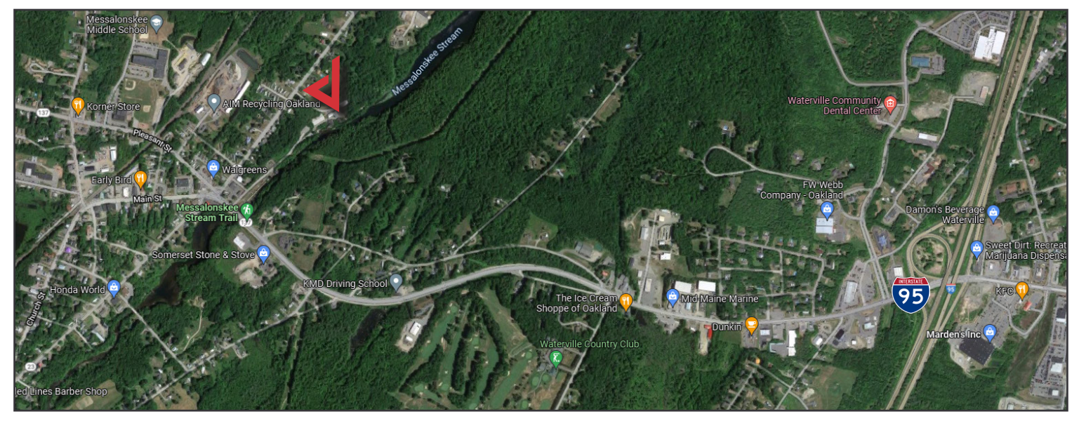
The information contained herein has been given to us by the owner of the property or other sources we deem reliable. We have no reason to doubt its accuracy, but we do not guarantee it. All information should be verified prior to purchase or lease.