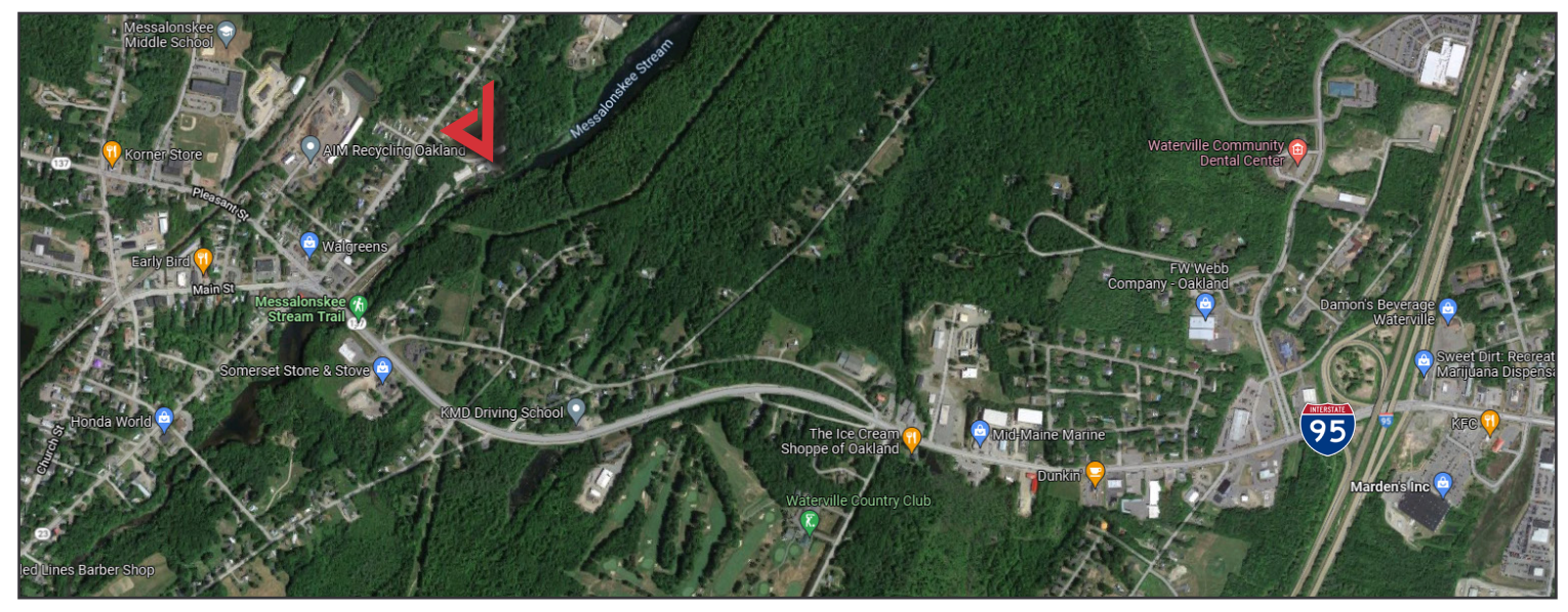
The information contained herein has been given to us by the owner of the property or other sources we deem reliable. We have no reason to doubt its accuracy, but we do not guarantee it. All information should be verified prior to purchase or