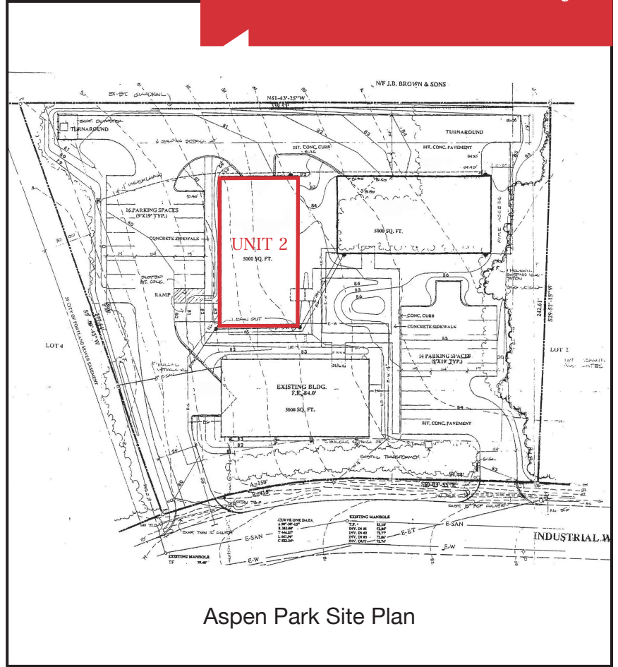
Aspen Park Site Plan