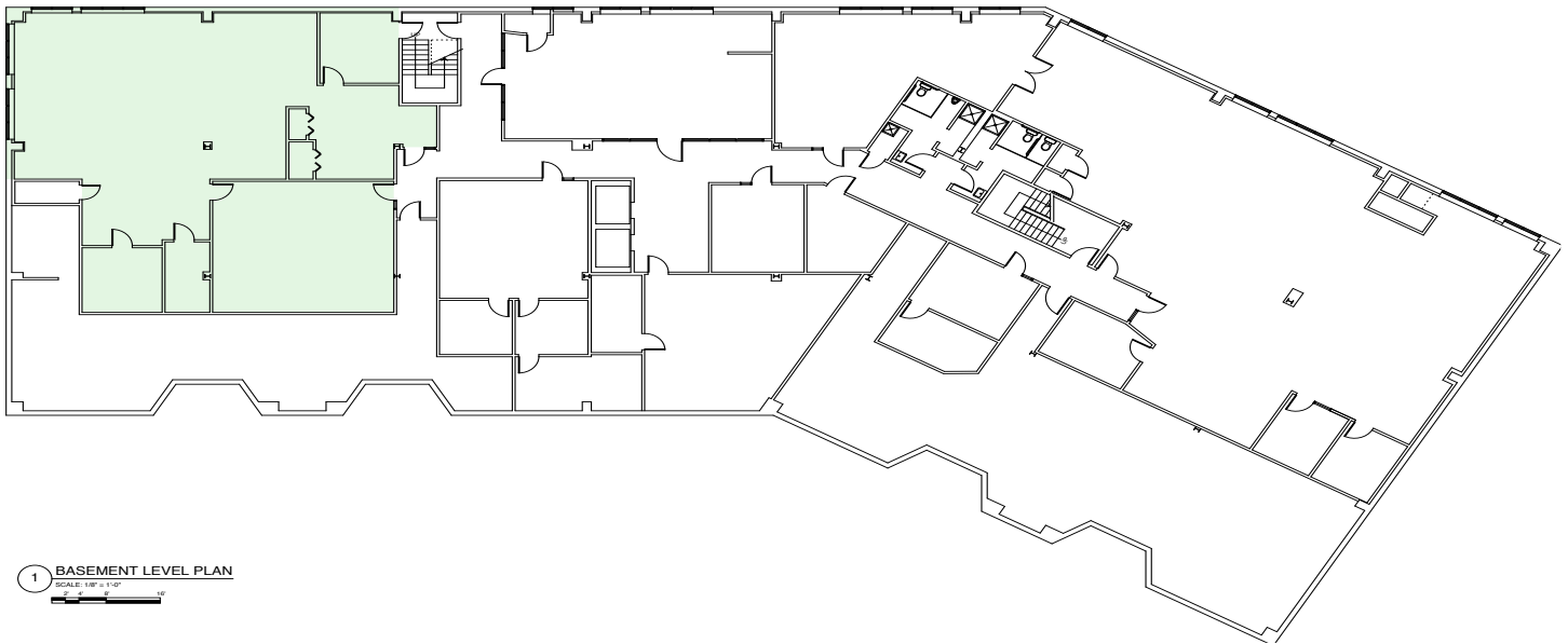
1 BASEMENT LEVEL PLAN SCALE: 1/8" = 1'-0"