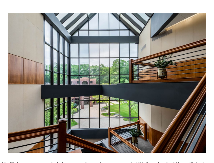
The information contained herein has been given to us by the owner of the property or other sources we deem reliable. We have no reason to doubt its accuracy, but we do not guarantee it. All information should be verified prior