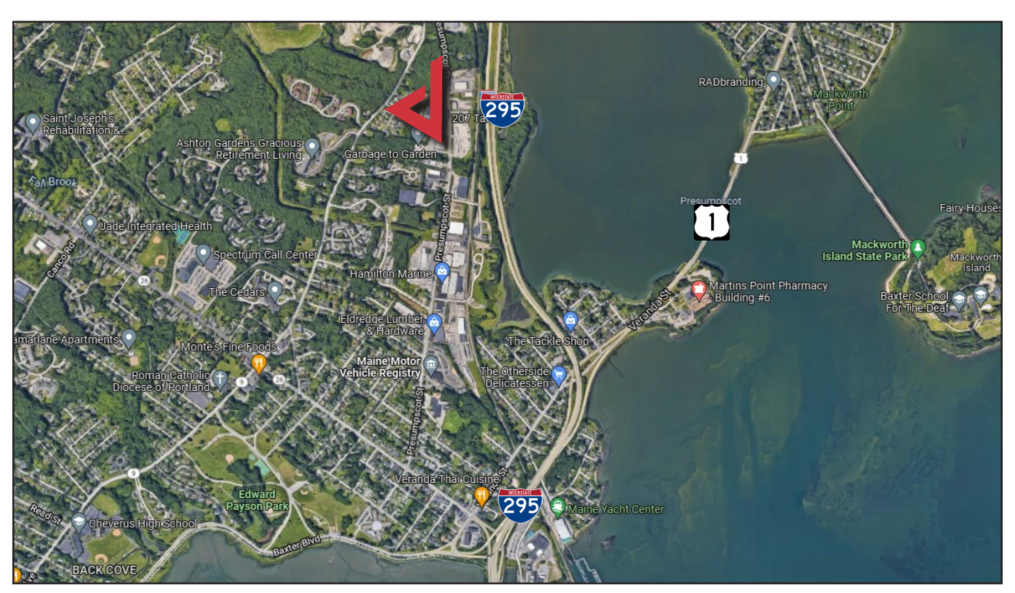
The information contained herein has been given to us by the owner of the property or other sources we deem reliable. We have no reason to doubt its accuracy, but we do not guarantee it. All information should be verified prior to purchase or lease.