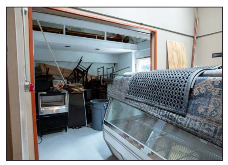
The information contained herein has been given to us by the owner of the property or other sources we deem reliable. We have no reason to doubt its accuracy, but we do not guarantee it. All information should be verified prior to purchase or lease.