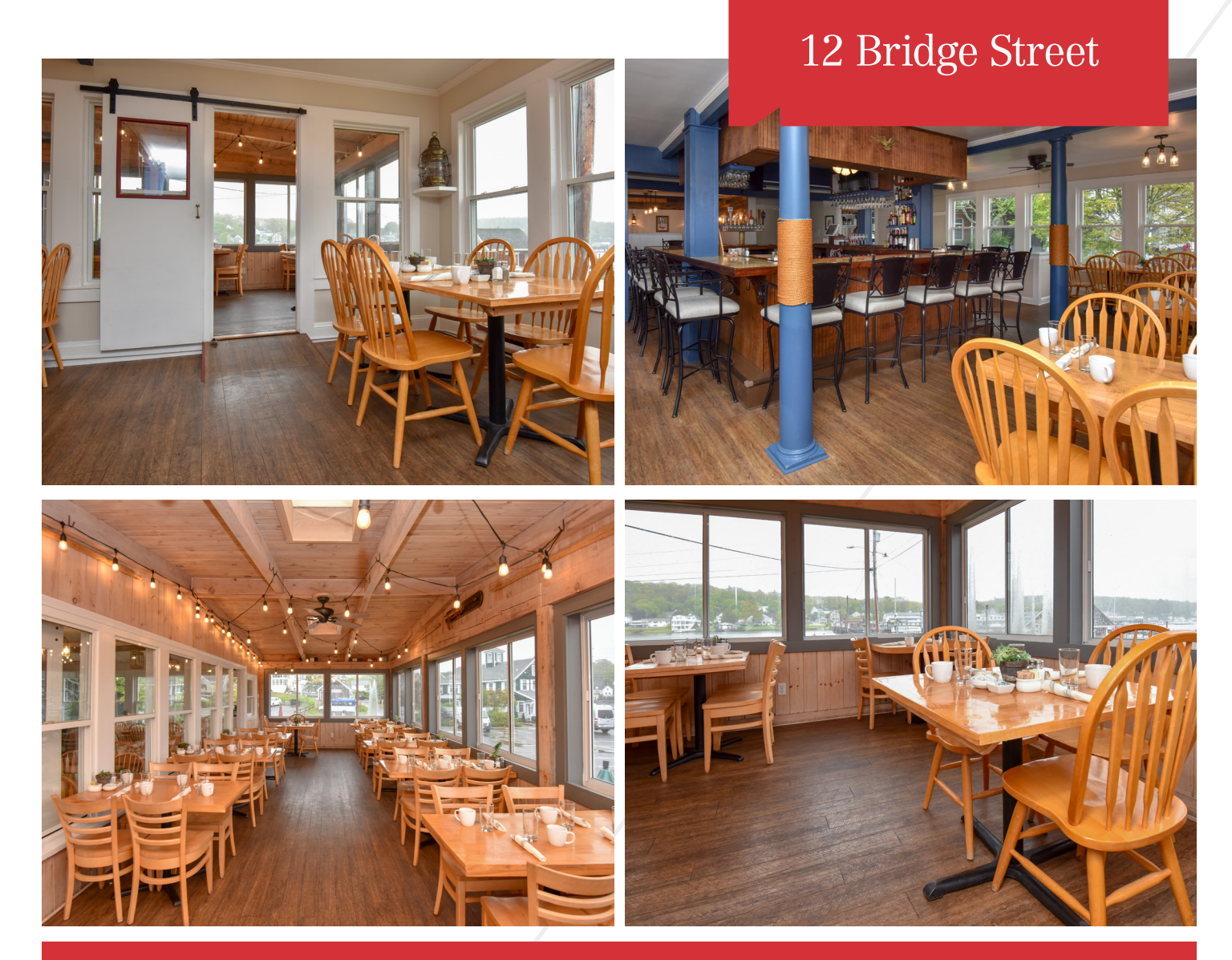
CLICK HERE TO VIEW VIRTUAL TOUR OF THE HARBORSIDE TAVERN