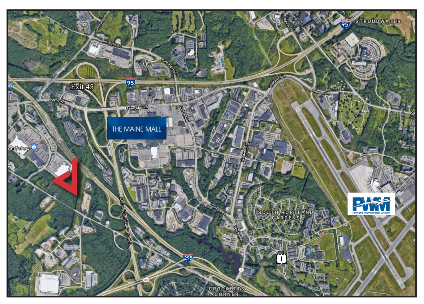
The information contained herein has been given to us by the owner of the property or other sources we deem reliable. We have no reason to doubt its accuracy, but we do not guarantee it. All information should be verified prior to purchase or lease.