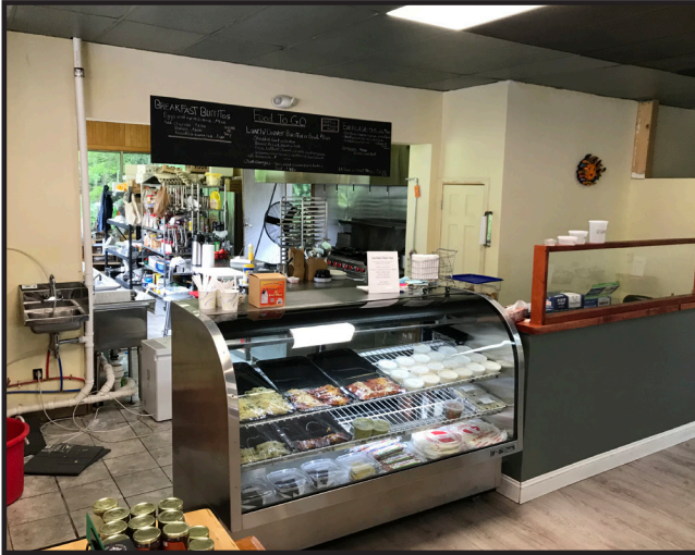
Building 2- Retail/Warehouse